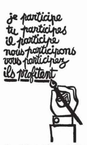
FIGURE 1 French Student Poster. In English, I participate; you participate; he participates; we participate; you participate . . . They profit.

There is a critical difference between going through the empty ritual of participation and having the real power needed to affect the outcome of the process. This difference is brilliantly capsulized in a poster painted last spring by the French students to explain the student-worker rebellion.<sup>2</sup> (See Figure 1.) The poster highlights the fundamental point that participation without redistribution of power is an empty and frustrating process for the powerless. It allows the powerholders to claim that all sides were considered, but makes it possible for only some of those sides to benefit. It maintains the status quo. Essentially, it is what has